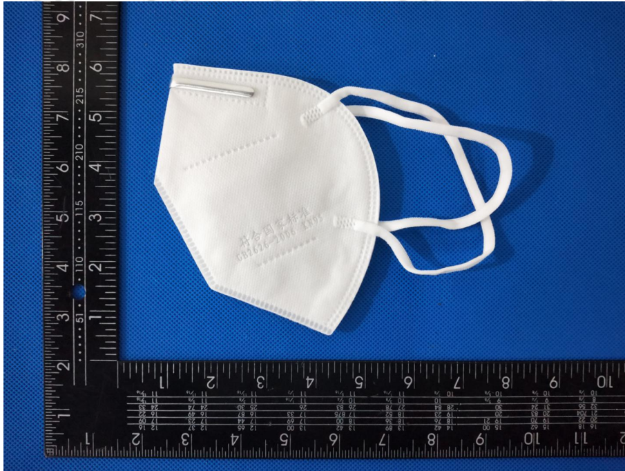
Photo 1 Overview